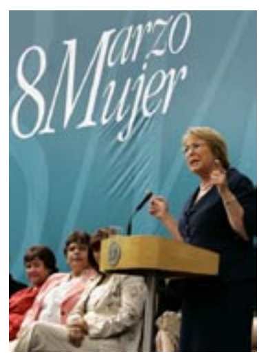
The more self-confident the democracy, the greater the variety of candidates. Michelle Bachelet's election as Chilean president expanded political horizons for women.

Democratic elections are competitive. Opposition parties and candidates must enjoy the freedom of speech, assembly, and movement necessary to voice their criticisms of the government openly and to bring alternative policies and candidates to the voters. Simply permitting the opposition access to the ballot is not enough. The party in power may enjoy the advantages of incumbency, but the rules and conduct of the election contest must be fair. On the other hand, freedom