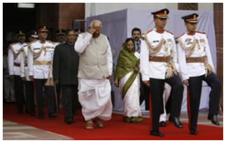
Some democracies combine elements of presidential and parliamentary systems: above, Indian President Pratibha Patil arrives at swearing-in ceremony, 2007.

For authoritarians and other critics, a common misapprehension is that democracies, lacking the power to oppress, also lack the authority to govern. This view is