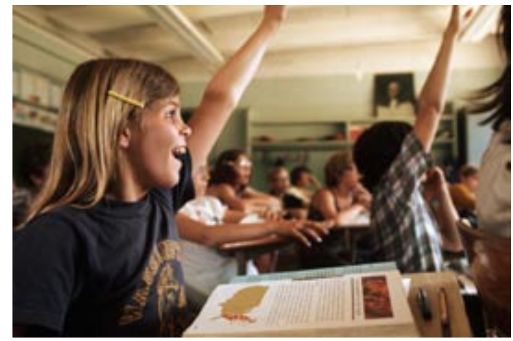
An educated citizenry is, potentially, a free citizenry.

There is no easy solution to the conflict-consensus equation. Democracy is not a machine that runs by itself once the proper principles are inserted. A democratic society needs the commitment of citizens who accept the inevitability of intellectual and political conflict as well as the necessity for tolerance. From this perspective, it is important to recognize that many conflicts in a democratic society are not between clearcut "right" and "wrong" but between differing interpretations of democratic rights and social priorities.