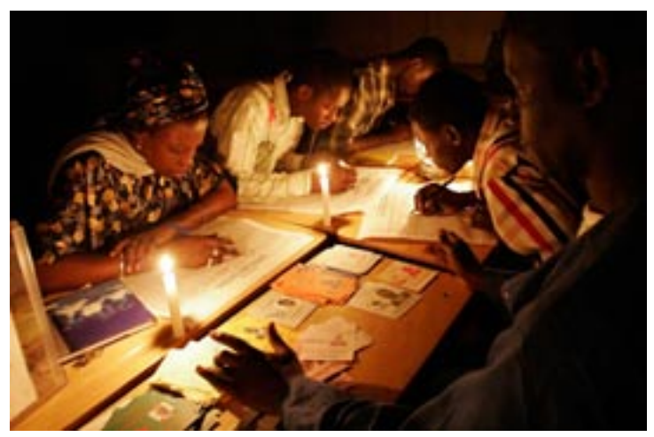
Election workers count votes by candlelight in Dakar, Senegal.

society. The opposition continues to participate in public life with the knowledge that its role is essential in any democracy. It is loyal not to the specific policies of the government, but to the fundamental legitimacy of the state and to the democratic process itself.