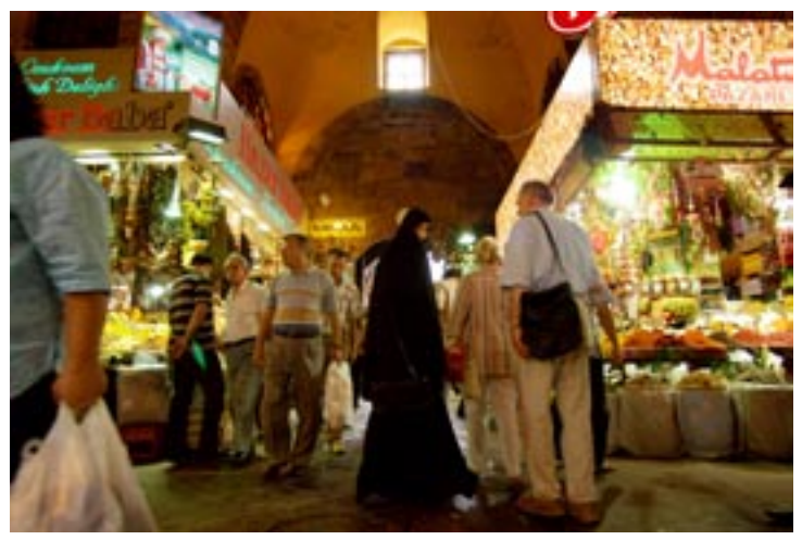
Democratic development and economic prosperity often go hand in hand: above, a market in Istanbul.