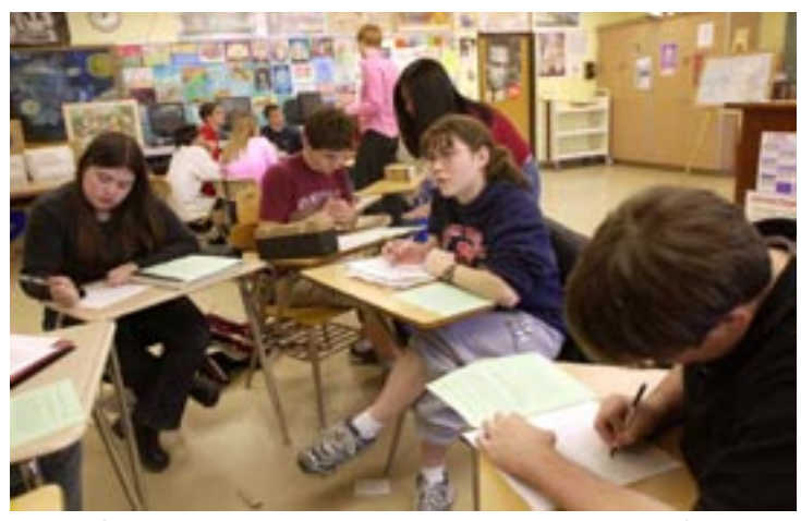
In the U.S. federal system, institutions such as the police and schools are largely funded and managed at the local level.

The United States, for example, is a federal republic with states that have their own legal standing and authority independent of the federal government. Unlike the political subdivisions in nations such as Britain and France, which have a unitary political structure, American states cannot be abolished or changed by the federal government. Although power at the national level in the United States has grown significantly,