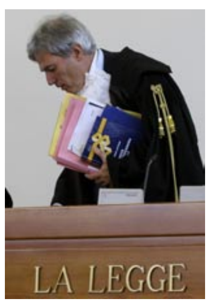
A judge leaves his bench during a criminal trial in Rome, 2005. The judge's costume reflects centuries of legal tradition.

Whether elected or appointed, judges must have job security or tenure, guaranteed by law, in order that they can make decisions without concern for pressure or attack by those in