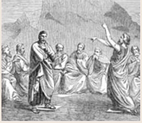
Civilized debate and due process of law are at the core of democratic practice. This woodcut imagines an ancient Greek court on the Areopagus outcrop in Athens.

Democracy, which derives from the Greek word "demos," or "people," is defined, basically, as government in which the supreme power is vested in