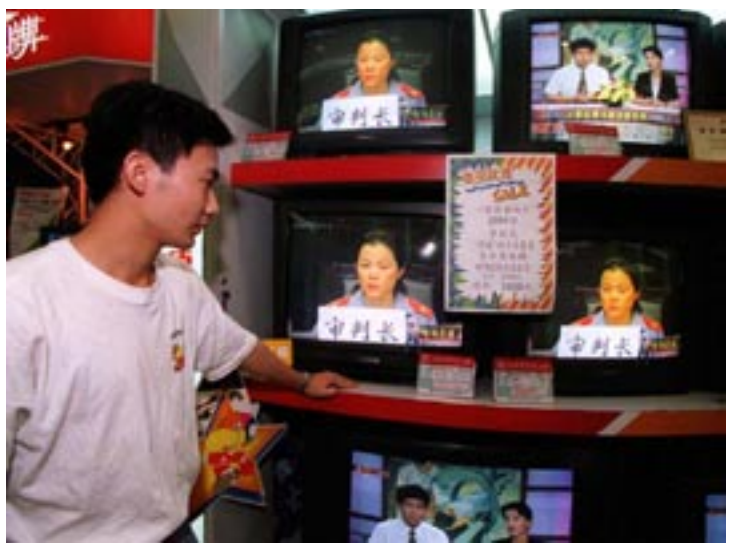
Open access to judicial proceedings is part of the free flow of information. Here, a man in China watches a televised trial.

among different interest groups; educate the public about public issues; and provide structure and rules for the society's political debate. In some political systems, ideology may be an important factor in recruiting and motivating party members. In others, economic interests or social outlook may be more important than ideological commitment.