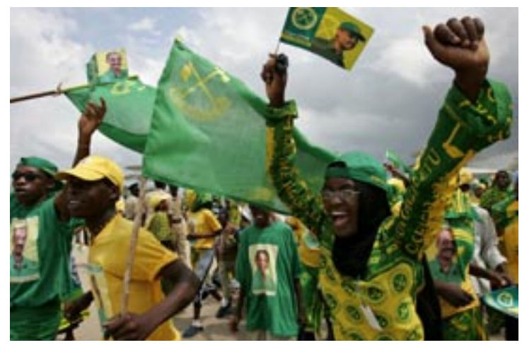
Freedom of expression also takes the form of peaceful assemblies and demonstrations. Above: political rally, Zanzibar, 2005.

Citizens of a democracy live with the conviction that through the open exchange of ideas and opinions, truth will eventually win out over falsehood, the values of others will be better understood, areas of compromise more clearly defined, and the path of progress opened. The greater the volume of