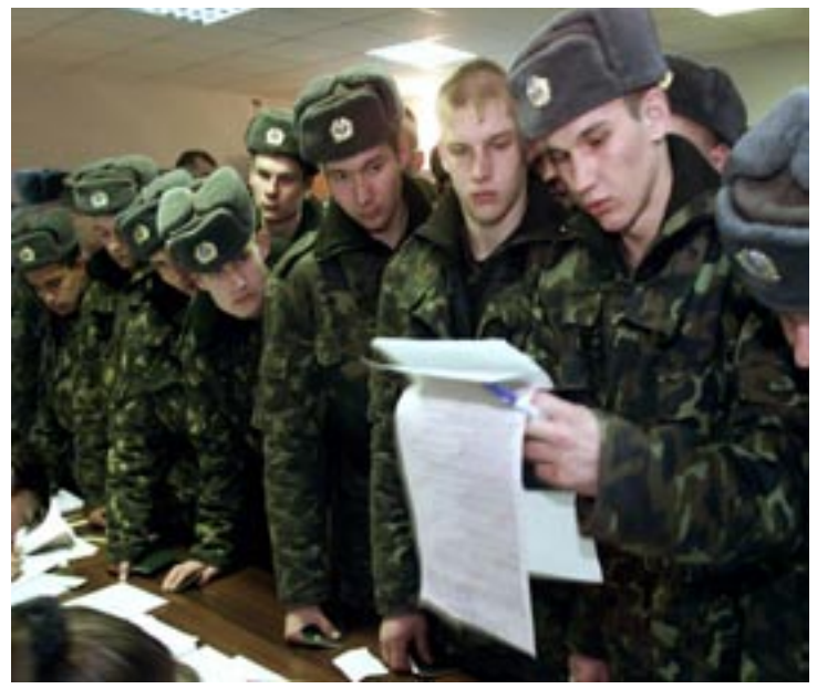
Ukranian soldiers examine ballots in Kiev in 2002.

In democracies, defense issues and threats to national security must be decided by the people, acting through their elected representatives. A democracy's military serves its nation