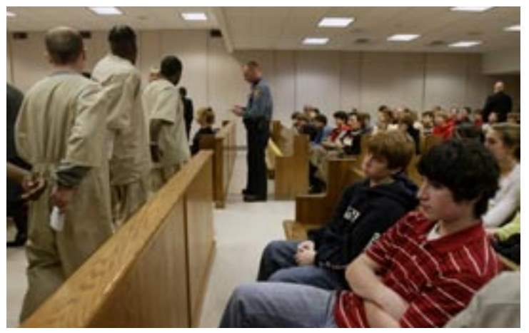
In democracy, trials are open to the public. Here, a group of American teens gets a civics lesson and a symbolic choice.

The rule of law protects fundamental political, social, and economic rights and defends citizens from the threats of both tyranny and lawlessness. Rule of law means that no individual, whether president or private citizen, stands above the law. Democratic governments exercise authority by way of the law