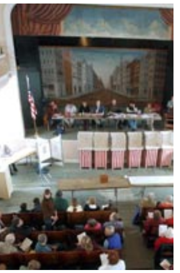
Some local jurisdictions in the United States still practice a form of direct democracy, as in this town meeting in Harwick, Vermont. Schools and taxes tend to be popular issues.

Some U.S. states, in addition, place "propositions" and "referenda" — mandated changes of law — or possible recall of elected officials on ballots during state elections. These practices are forms of direct democracy, expressing the will of a large population. Many practices may have elements of direct democracy. In Switzerland, many important political decisions on issues, including public health, energy, and employment, are subject to a vote by the country's citizens. And some