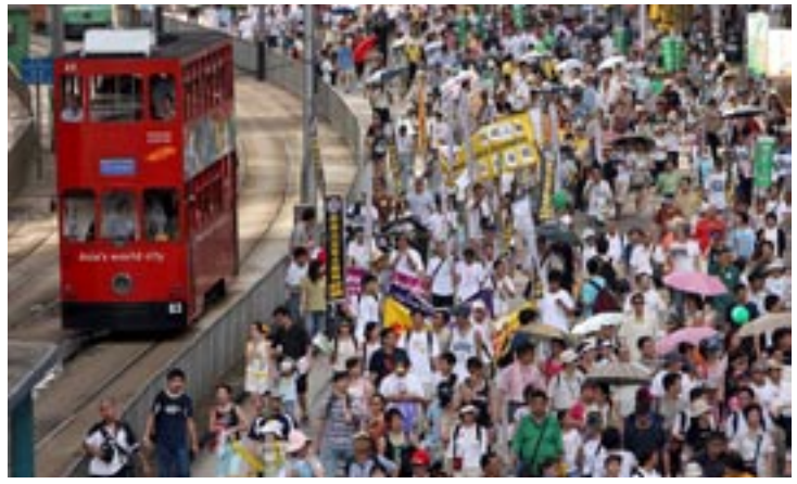
Democracy as hope: In 2006, 20,000 people marched in Hong Kong carrying banners reading "Justice, Equality, Democracy, and Hope."

of speech and assembly while countering speech that truly encourages violence, intimidation, or subversion of democratic institutions. One can disagree forcefully and publicly with the actions of a public official; calling for his (or her) assassination, however, is a crime.