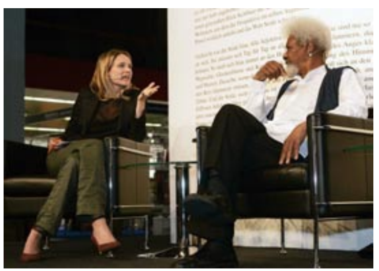
Public discussion on all kinds of topics – personal, cultural, political – is the lifeblood of democracy. Above: Nigerian Nobel-prize winner Wole Soyinka at a Swiss book fair.

can explore the possibilities of peaceful self-fulfillment and the responsibilities of belonging to a community — free of the potentially heavy hand of the state or the demand that they adhere to views held by those with influence or power, or by the majority.