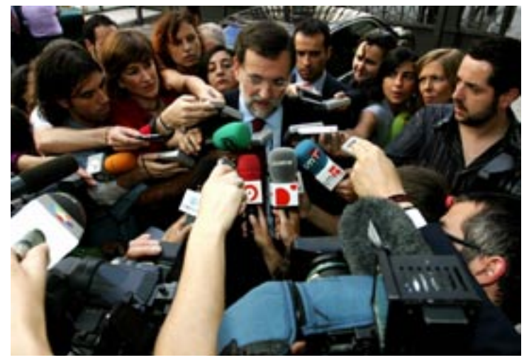
When out of office, the "loyal opposition" criticizes and checks the government. Spain's opposition party leader speaks to the press.

Legislators have a responsibility to articulate their views as effectively as possible. But they must work within the democratic ethic of tolerance, respect, and compromise to reach