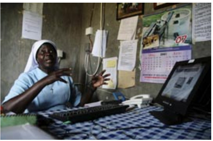
Non-governmental organizations work worldwide. Here, a Uganda aid worker uses a solarpowered computer provided by an American NGO.

Governments and NGOs frequently work as partners.