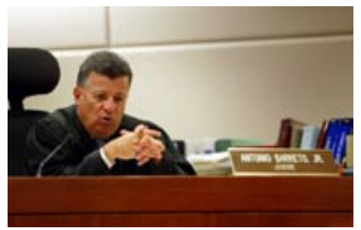
The professionalism of judges is one of their best defenses against social and political pressure.

In democracies, the protective constitutional structure and prestige of the judicial branch of government guarantees independence from political pressure. Thus, judicial rulings can be impartial, based on the facts of a case, legal arguments, and relevant laws — without restrictions or improper influence by the executive or legislative branches. These principles ensure equal legal protection for all.