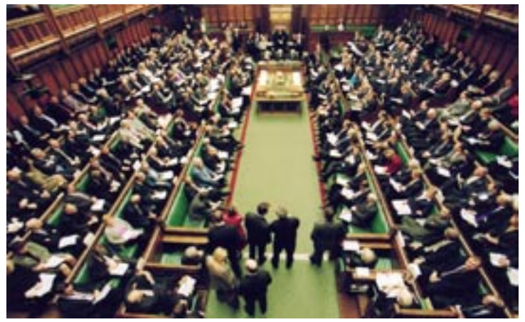
England's House of Commons, the lower chamber of the British Parliament, is one of the world's oldest and most successful democratic institutions.

In a presidential system, by contrast, the president usually is elected separately from the members of the legislature. Both the president and the legislature have their own power bases and political constituencies, which serve to check and balance each other.