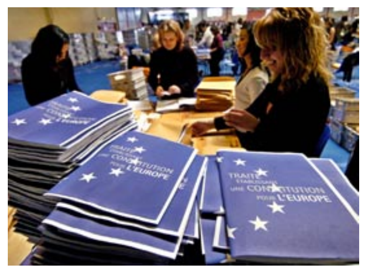
As democracies become stable, they permit more freedoms. When French voters were given the right to vote by referendum on the proposed European Constitution (here being mailed to them in May 2005), they expressed their binding opinion by rejecting it.

Citizenship in a democracy requires participation, civility, patience — rights as well as responsibilities. Political scientist Benjamin Barber has noted, "Democracy is often understood as the rule of the majority, and rights are understood more and more as the private possessions of individuals. ... But this is to misunderstand both rights and democracy." For democracy to succeed, citizens must be active, not passive, because they know that the success or failure of the government is their responsibility, and no one else's.