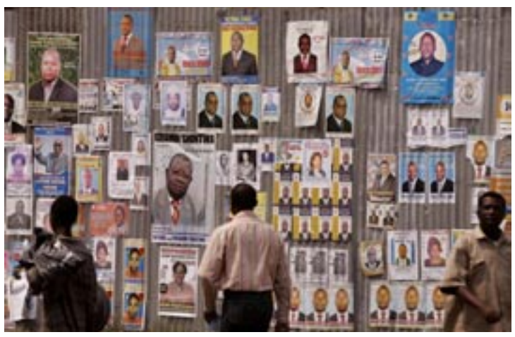
Free choice is essential in elections. Here, voters in the Democratic Republic of Congo peruse choices in 2006.

chief decision-makers in a government are selected by citizens who enjoy broad freedom to criticize government, to publish their criticism, and to present alternatives."