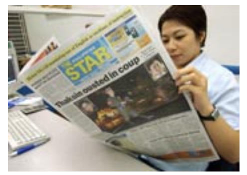
Freedom of expression relies on vibrant, multi-faceted press and information services.

but distinctive functions that remain fundamentally unchanged. One is to inform and educate. To make intelligent decisions about public policy, people need accurate, timely, unbiased information. However, another media function may