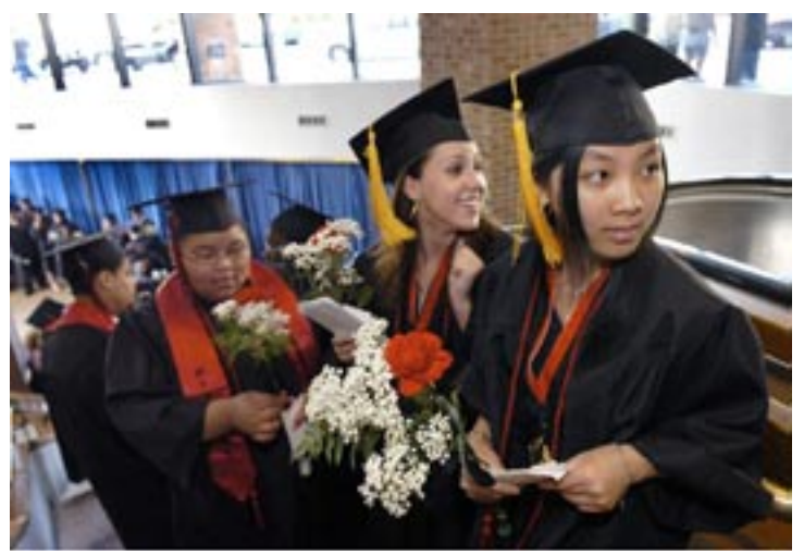
An educated citizenry is the best guarantee for a thriving democracy.

characterizes all modern democracies, no matter how varied in history, culture, population, and economy.