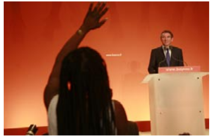
Aggressive questioning of political figures is routine in free societies. Above, a journalist directs a question at a French presidential candidate.

Political parties recruit, nominate, and campaign to elect public officials; draw up policy programs for the government if they are in the majority; offer criticisms and alternative policies if they are in opposition; mobilize support for common policies