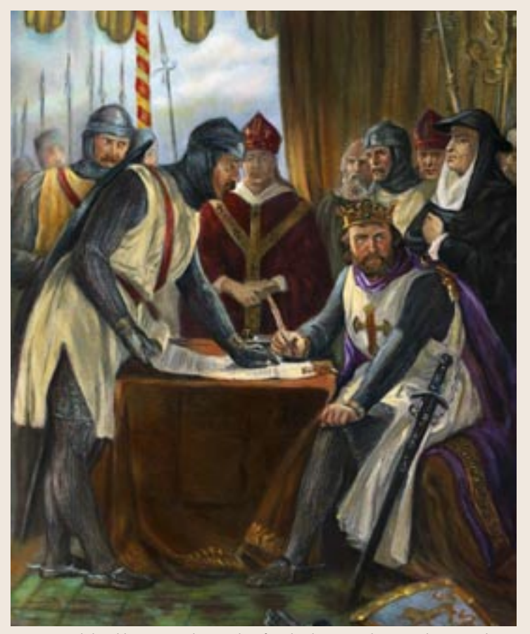
In 1215, English nobles pressured King John of England to sign a document known as the Magna Carta, a key step on the road to constitutional democracy. By doing so, the king acknowledged he was bound by law, like others, and granted his subjects legal rights.

Abraham Lincoln, democracy is government "of the people, by the people, and for the people."