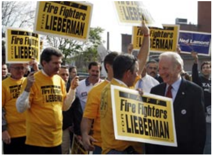
Connecticut senatorial candidate Joseph Lieberman courts firefighters in 2006. Interest groups are wooed and won by politicians one at a time.

where rival Republican and Democratic parties are decentralized organizations functioning largely in Congress and at the state level — which then coalesce into active national organizations every four years to mount presidential election campaigns. Election campaigns in a democracy are often elaborate, timeconsuming, and sometimes silly. But their function is serious: to provide a peaceful and fair method by which the people can select their leaders and determine public policy.