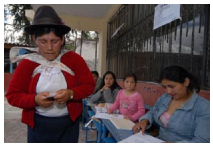
Citizens vote on laws and issues as well as candidates for office. This 2007 photo shows an Ecuadorian woman voting on constitutional reform.

leadership of the government for a set period of time. Popularly elected representatives hold the reins of power; they are not simply figureheads or symbolic leaders.