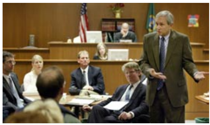
Rule of law can be complicated: above, a lawsuit alleging wrongful employment termination begins in court in the State of Washington, 2005.

• Persons shall not be subject to double jeopardy; that is, they cannot be charged with the same crime a second