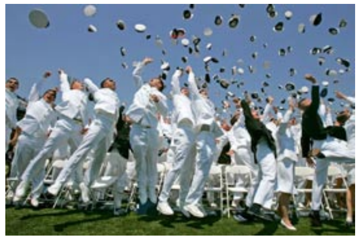
U.S. military cadets throw their hats in the air upon graduation. A professional military needs to be as well educated as its civilian overlords.

before becoming involved in politics; armed services must remain separate from politics. The military are the neutral servants of the state and the guardians of society.